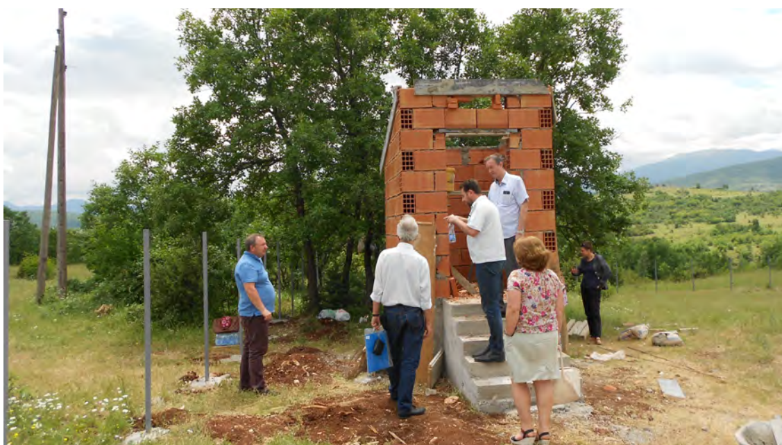
Photo: building a urine-diverting dry toilet (UDDT) in Macedonia, to demonstrate affordable sanitation that does not pollute drinking water sources.

In the 3 Balkan countries, one village each has been selected where alternative solutions were constructed , such as a Urine Diverted Dry Toilet (UDDT), a waste-water filter and a demonstration food garden using compost. All villages are in environmentally sensitive areas. The results have raised awareness on how to prevent environmental pollution by using non-chemical alternatives and implementation of ecological and affordable sanitation.