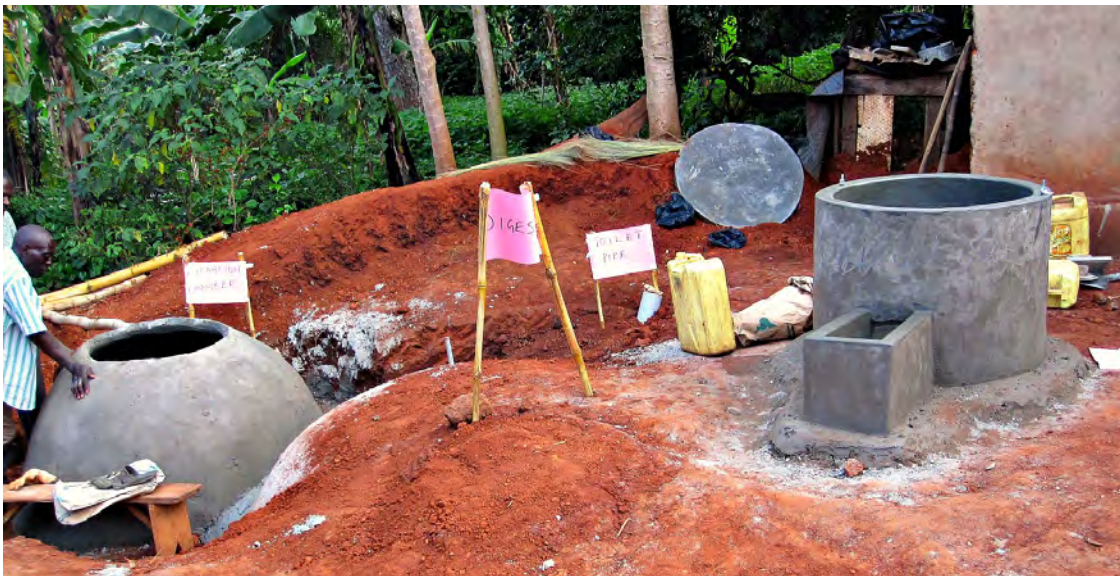
A biogas toilet build by ARUWE and residents of the Mulagi district

Yet still, the use of fire wood would require the physical presence of women while preparing household meals which take long. This situation made it difficult for women to have time for participating in community, group and other economic activities. The current practice of using firewood which is the main source of energy gives off a lot of smoke which is a health hazard to women and their children. In addition to the above, currently in Kyankwanzi women and children walk long distances in search of water for house hold use, which in some cases may not be clean or safe water for consumption. The Safe Water Coverage is still low at 51% which is below the millennium development goal water target.