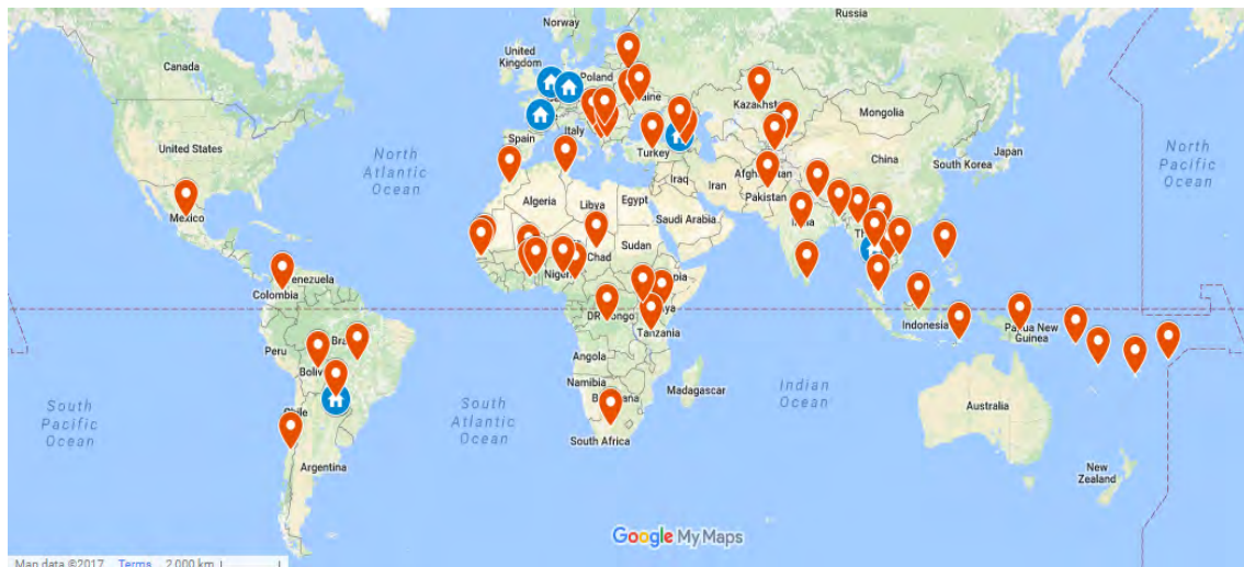
Photo: map of project partners and activities of the Women2030 program