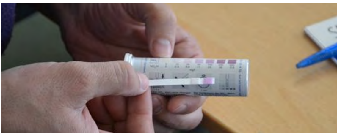
Photo: taking water samples as part of monitoring of local drinking water wells by pupils and teachers in the Balkan region

WECF developed a methodology for engagement of stakeholders from local authorities and schools; the "Compendium on Water and Sanitation Safety Planning". WECF has adapted and translated this compendium for use in Romania, Macedonia, Bulgaria, and Albania, so that it can be used in the whole Balkan region to raise awareness about environmental protection, water quality and sanitation in rural communities. The introduction of a Water and Sanitation Safety Plan (WSSP) approach with an updated compendium encouraged local women and men to take action for the improvement of water supply and sanitation systems, with the active participation of students and youth.