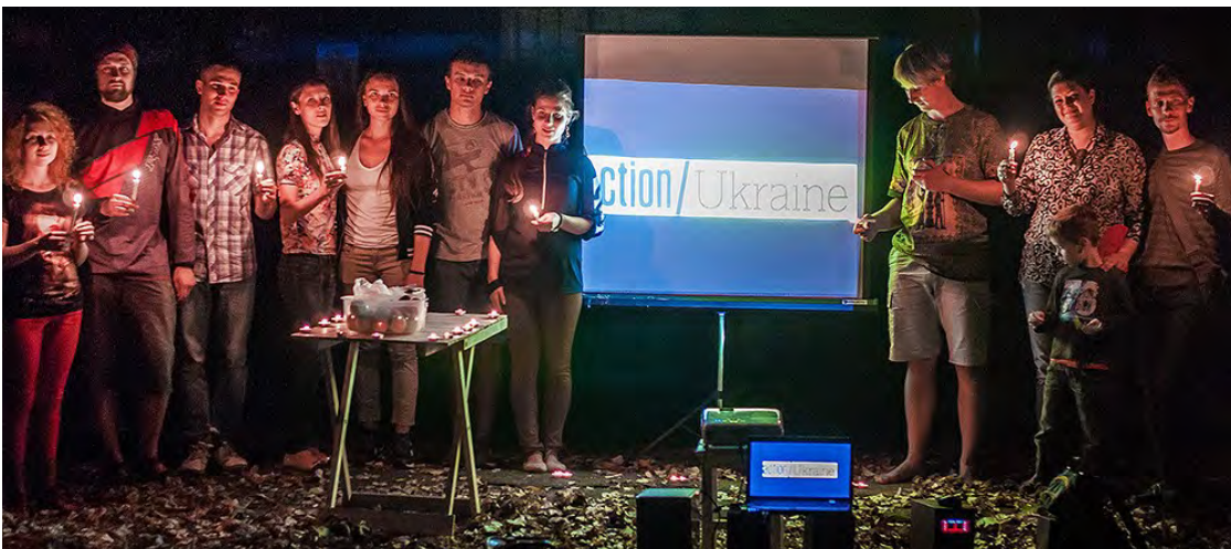
WECF partners in Ukraine presenting their recommendations on energy and climate policies

The lessons learned from WECF's local projects need to be taken into national budget, policies and program planning, to ensure that best practices are replicated. Having strong global agreements on gender equality, environment and climate, also help to create support for improvements at national level. WECF's approach of bringing more women into policy making and decision-making processes, is an aim itself and ensures more effective and equitable policies.