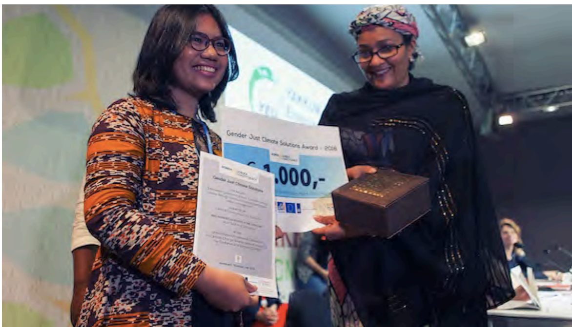
Photo: Amina Mohammed, then Minister of Environment Nigeria, presenting the Gender Climate Award to Indonesian Women's organisation organized by WECF with the Women & Gender Constituency at COP22

At UNFCCC, WECF advocates the need for equitable climate policies and programs as part of the Women and Gender Constituency. In many countries, due to gender inequalities, women are more vulnerable to the effects of climate change than men. Women also often have knowledge and expertise that can be used in climate change mitigation and adaptation strategies. WECF promotes climate policies and programs, which give women access to resources, knowledge and income-generating opportunities.