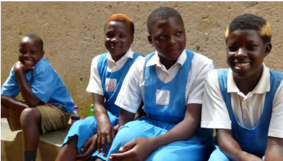
Photo: Some of the girls benefiting from the improved school sanitation program in Uganda

Many studies prove that access to sanitation and hand washings contributes even more to prevention of diarrhoea and respiratory diseases than access to clean water. Furthermore, human waste can - if correctly collected and treated like with the Ecosan technology - contribute to mitigation of poverty and improvement of the food situation. WECF have a lot of experience in terms of school sanitation and is motivated to support the municipality and Busi-school with building up safe and humane sanitary facilities.