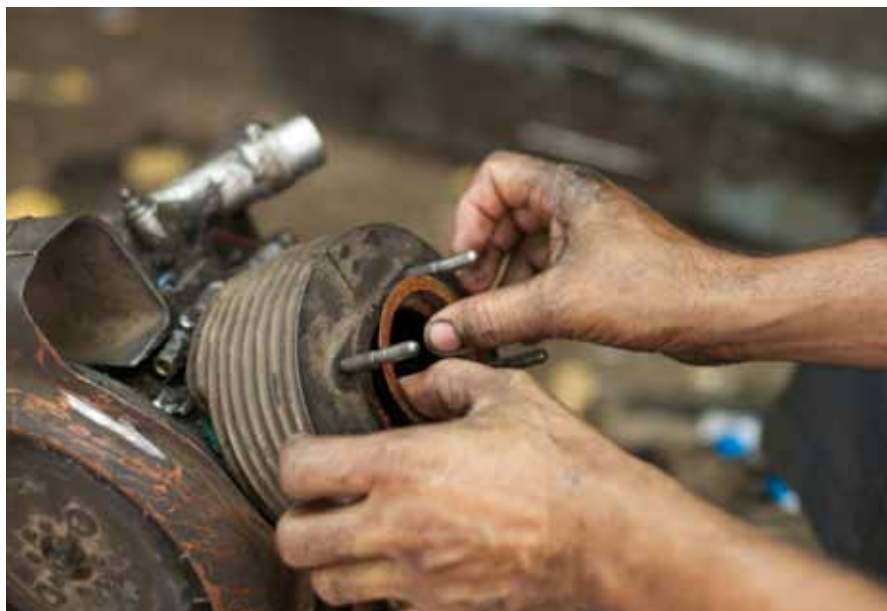
Replacing an asbestos gasket

Countries are allowed to grant permission for imports of chrysotile asbestos. There is no limit of volume or any other restriction regarding import and export.