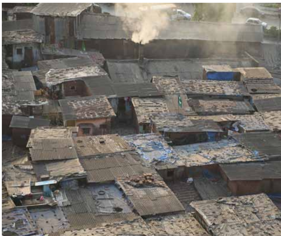
Asbestos containing roofing materials

For those victims it is incredibly difficult to get any compensation.