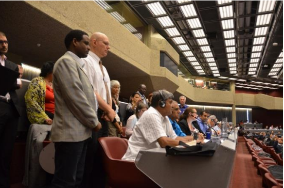
Photo10; after the victim's testimony, delegations began to applaud to encourage the victim who made it clear what Rotterdam Convention and government delegation had to do.