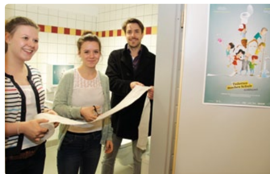
Top left: "Toiletten machen Schule" award ceremony with the winning schools in Berlin. Top right: Art project in one of the participating schools. Below right: Inauguration ceremony of the new school facilities.