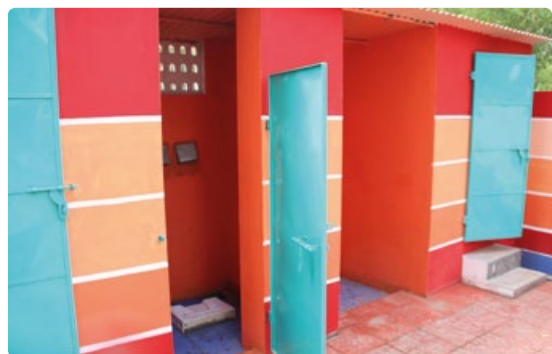
Top left: Adolescent school girls content with their new toilets. Top right: Newly built sanitation facility for girls with a large number of urinals and a few closed cubicles. Below right: Closed toilets and wash rooms with urinals for older students.