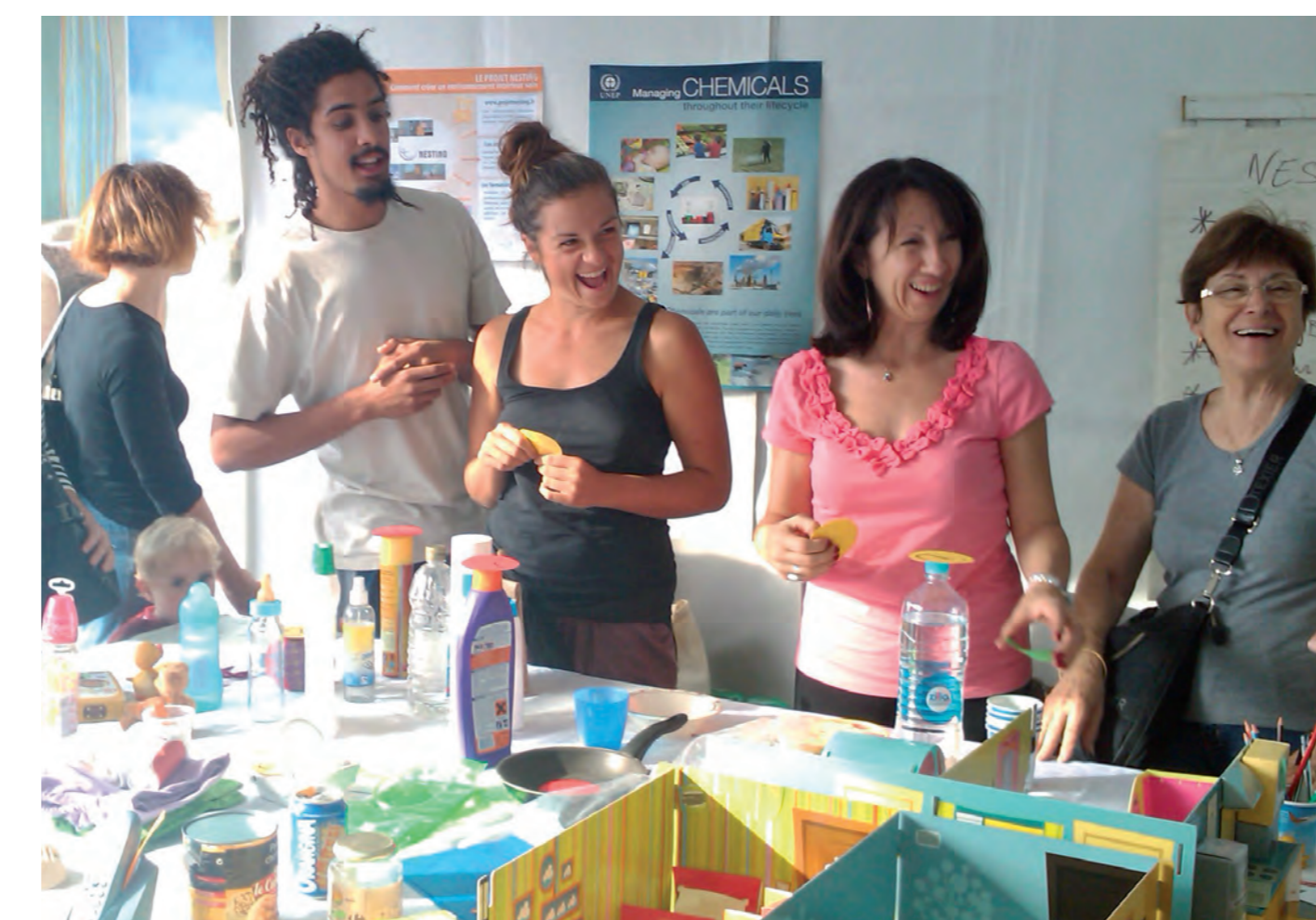
Nesting training in France

Funding: Referat für Gesundheit und Umwelt City of Munich, French Ministry of Environment, Région Rhône-Alpes, Région Ile-de-France