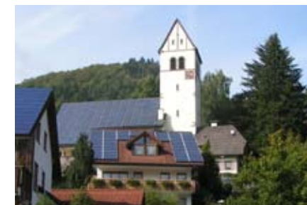
A sustainable supply of energy without nuclear power is feasible.