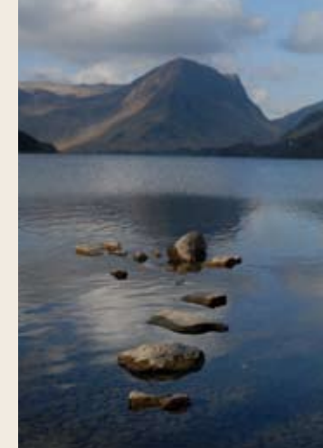
The Lake District seems to invite one to walk and swim.