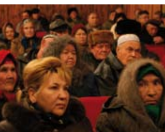
The population at Mayak suffers to this day.

Tens of thousands of babies in the Chernobyl region were born with genetic damage. Future generations will be affected by genetic defects in even greater numbers because the damage to human genetic material is seriously multiplied in each subsequent generation. However, the adverse impact of radioactivity is by no means limited to Eastern Europe. Studies show an increase of disease and deaths, related to Chernobyl - in Europe and around the world. However, an overall presentation of the health consequences of the disaster is impossible as data is still kept secret and research and the publication of studies is being thwarted.