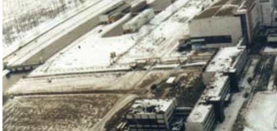
In Chernobyl two reactors are still in operation.

The big Mayak nuclear plant in the southern Urals was one of the production facilities for the first Soviet atomic bomb. It was part of the "exclusion zone" which had been created in 1945 between Chelyabinsk and Yekaterinburg, in order to cut off Soviet nuclear weapons production from the outside world. In the first years of operation, all the radioactive waste from Mayak's plutonium production was dumped in the nearby Techa river. The residents were left in the dark about this. Therefore, for sudden deaths, people used to call it "river disease". In 1957, due to failure at the cooling plant, a tank filled with highly radioactive waste exploded (also known as the "Kyshtym" accident). One year later, an area 300 km long and 70 km wide was declared a restricted zone. Hundreds of thousands of people developed chronic radiation sickness due to the high doses of radioactivity. For years, radioactive liquids from the reprocessing plant leaked into the neighboring Lake Karachay. When the lake dried up in