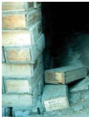
Radioactive monazite - stored in broken containers in an old, rundown warehouse in Krasnoufimsk.

Nuclear waste disposal has many uncertainties. Insulation would have to be safely ensured over hundreds of thousands of years. Due to the immensely long period needed, safe assurance is impossible to guarantee. In order to insulate the waste as much as possible, scientists look for certain geographical properties. One must assume, however, that geological conditions may change in the future. It is also uncertain, whether the desired geological characteristics actually exist anywhere in the storage site. The long-term stability of the containment vessel is also not tested. Due to gas development in the waste, an increase in pressure may occur, leading to an explosion. Additionally, there is always the risk of infiltrating waterways. Thus, radioactive substances can pollute the groundwater, as it has been the case in Asse, Germany. Numerous studies, including one from the United States National Academy of Sciences, come to the conclusion that it is only a matter of time until radionuclides pollute the biosphere, this means people, animals and plants. In a 2001 bill from the U.S. Federal Government to amend the Atomic Energy Act, it says literally: The problem of permanent and safe disposal of highly radioactive nuclear material is "everywhere currently practically unresolved".