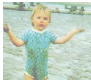
Beach games with far-reaching consequences.