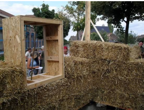
Picture 1 Straw bales are filled into a wooden frame

Straw bale building typically consists of stacking rows of bales (often in running-bond) on a raised footing or foundation, with a moisture barrier or capillary break between the bales and their supporting platform. Bale walls can be tied together with pins of bamboo, rebar, or wood (internal to the bales or on their faces), or with surface wire meshes, and then stuccoed or plastered. The bales may actually provide the structural support for the building ("load-bearing" or "Nebraska-style" technique), as was the case in the original examples from the late 19th century.