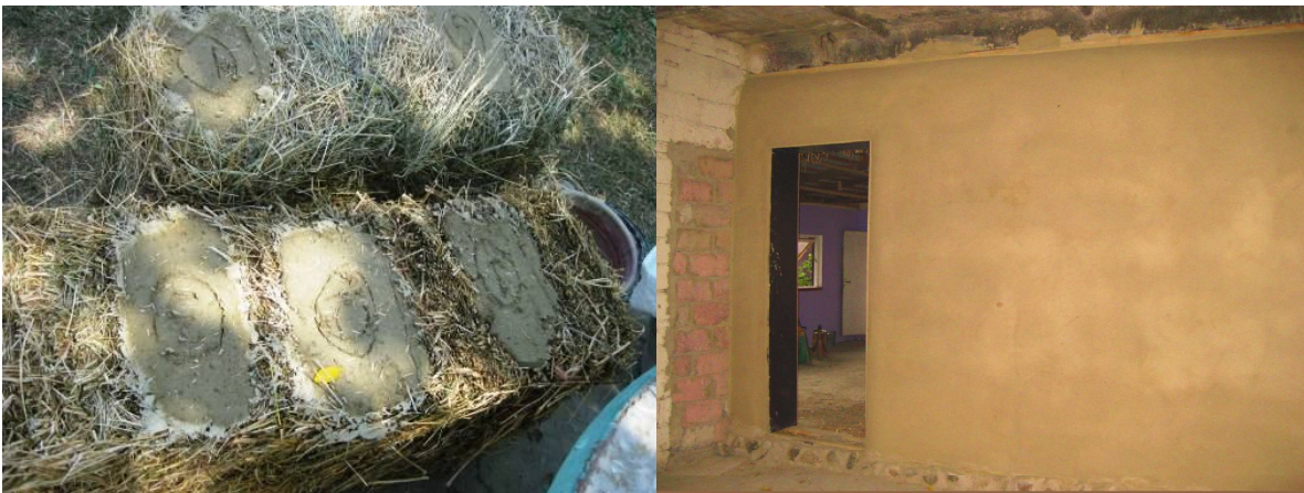
Picture 9 the right plaster mixture was identified by experimenting Picture 10 the final layer of plastering gives a beautiful look

As a rule the inner layers are more sandier than the outer layer. The more clay, the thinner the layer has to be because clay tends to crack. The thicker the layer, the higher the chance for cracks. As a rule of thumb, no more than 5 cm at a time should be applied.