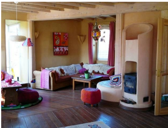
Picture 12- 13 Straw bale houses can be very comfortable and beautiful