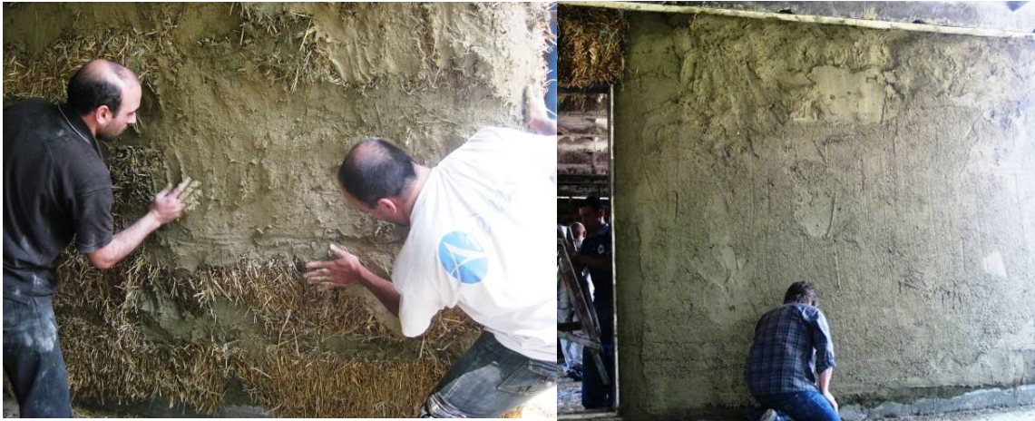
Pictures 4-8 show the different layers of plastering, filling the gaps and the first and second layers

In the Netherlands, the plaster is delivered ready made to the building site. In Georgia the right mixes have to be identified. This can be done by making different mixtures with small cups to test their quality by applying them on small pieces of wall.