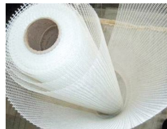
Picture 11 Glass fiber mesh

It is possible but not needed to use armature in the plaster. The experts recommend to use glass fiber mesh or jute for strengthening the second layer. Chicken wire is also possible, but costly and might cause cracks on the places where the iron runs. Iron is extending and decreasing under influence of temperature, causing cracks in the plaster.