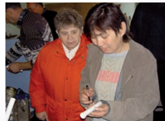
Bringing learned on making pumps in the praxis