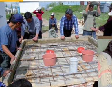
Hands-on training: left: construction of a UDDT right: construction of a compost bin