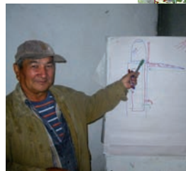
Participant presents results of a workshop