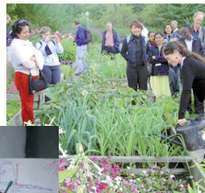
Demonstration of fertilising with ecosan products