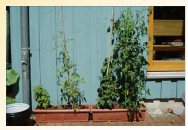
How urine application improves the yield

The nutrients in urine are easily taken up by plants. The fertilised plant will grow faster, develop more leaves and produce higher yields. Applying urine to crops instead of chemical fertilisers saves money and energy and produces a similar yield. One person produces about