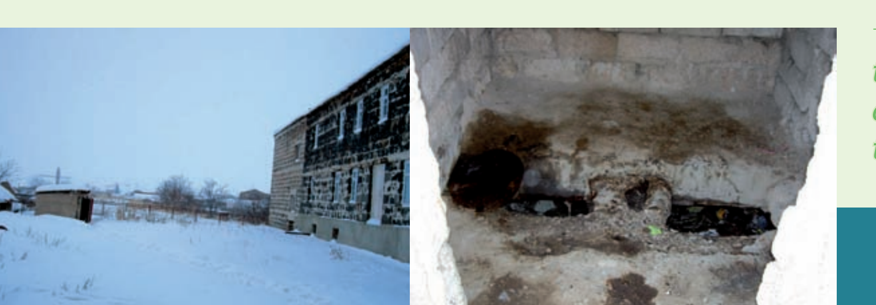
\rightarrow Using these toilets affects the dignity

→ In winter the temperature is far below zero – visiting the latrine is a threat to the children's health