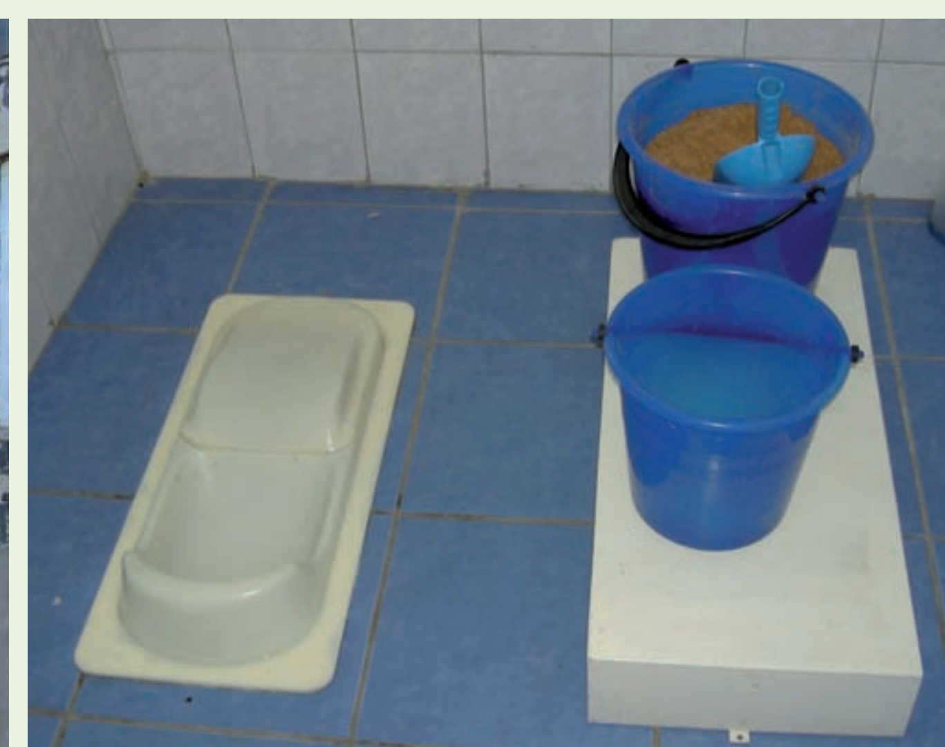
\rightarrow The first indoor dry urine diverting school toilet facility in Armenia